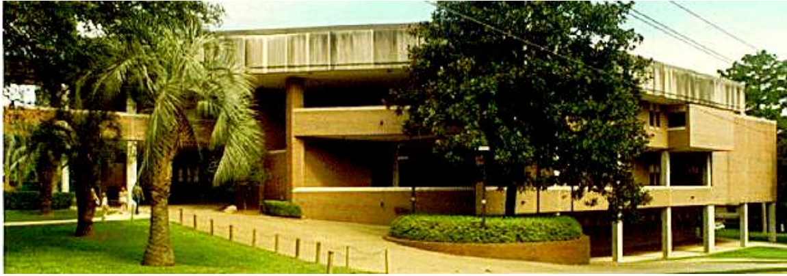
Picture of the building